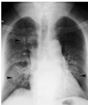
Fig 1 Chest radiograph showing bibasal and right upper lobe air space shadowing